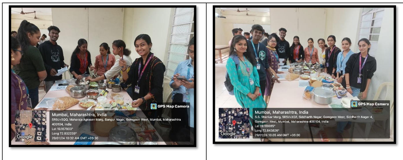
Food Stall at Yug